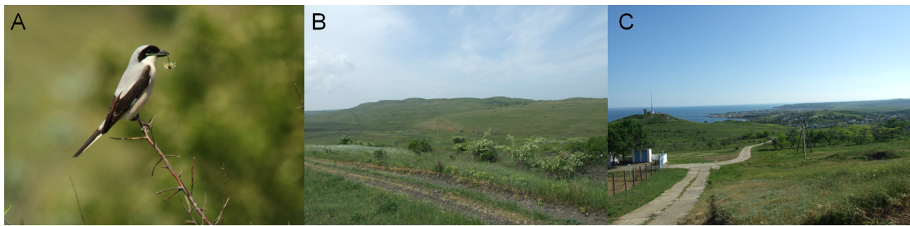
Fig. 1. Photographs documenting (A) studied species, the lesser grey shrike ( Lanius minor ), and habitat types differing in the level of anthropogenic disturbance inhabited by this species on the Crimean Peninsula, including (B) rural (Beherove; 45°26'01" N, 36°14'55" E; 15 May 2013), and (C) suburban areas (Kercz lighthouse; 45°23'08" N, 36°38'13" E; 19 May 2013).

et al. 2014, Moss et al. 2014). For example, European and Australian bird species with declining populations are less tolerant of an approaching human than species with increasing populations (Møller et al. 2014). Escape behaviour of animals is affected by several factors, such as the distance at which an approach begins (Blumstein 2003, Tryjanowski et al. 2020, Mikula et al. 2021), body mass and overall pace-of-life strategy (Stankowich & Blumstein 2005, Weston et al. 2012), sex and age (Kalb et al. 2019), flock size (Morelli et al. 2019, Tryjanowski et al. 2020), but also more subtle risk cues, such as human gaze and head orientation (Bateman & Fleming 2011, Clucas et al. 2013), and directness (Møller & Tryjanowski 2014) and speed of approach (Stankowich & Blumstein 2005). Based on their traits, some species are expected to have a decreased ability to cope with human disturbance and the identification of these may help in their conservation management (Samia et al. 2015b). However, the flexibility in behavioural responses towards human presence remains unexplored for many populations and species of animals.