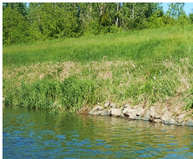
Fig. 1. Illustration of a vegetated stretch (left) and cleared stretch (right) of rip-rap bank stabilisation along the River Dyje (Czech Republic), used for testing preference or avoidance of rip-rap by three fish groups, i.e. round goby, tubenose goby and non-gobiid species.

Since 2014, a series of exceptionally dry years and a shift in peak rainfall has affected the river's hydrological regime, resulting in lowered water levels, reduced flow rates and a lack of flood events. A subsequent increase in siltation along the banks covered the rip-rap, which quickly became overgrown with filamentous algae and aquatic and riparian vegetation, especially reed canary