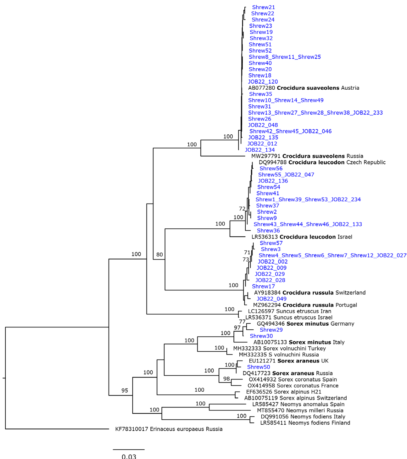
Fig. 2. Neighbor-Joining tree of cytochrome b sequences from shrew samples captured during the 2022 fieldwork in the westernmost part of the Czech Republic. A sequence of Erinaceus europaeus was used as the outgroup. The evolutionary distances were computed using the Kimura2-parameter model. Bootstrap values based on 1,000 pseudoreplicates are shown next to branches. The scale bar represents the expected number of substitutions per site under the K2P model. For GenBank sequences, the accession number and the country of origin are mentioned.

°C for 30 sec, and 72 °C for 1 min and ending with an extension step of 72 °C for 5 min. PCR products were visualised on a 1.5% agarose gel, purified, and Sanger sequenced from a single direction at Eurofins Genomics (Ebersberg, Germany) using primer L14723. Sequences were visually inspected in Geneious Prime software and trimmed to remove