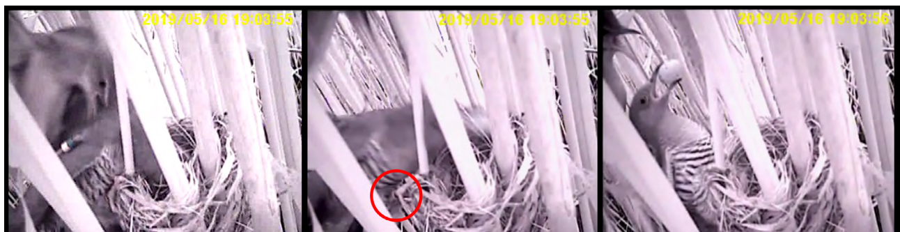
Fig. 2. Screenshots from the video-recording in which a female common cuckoo was knocked down from the nest by the great reed warbler female. The nest contained three host eggs and the cuckoo removed one of them during the attacks by the host female. The female cuckoo did not lay her own egg. The second frame shows that the cuckoo had a ring on her right tarsus (in the red circle). For the whole video, see supplementary online material.